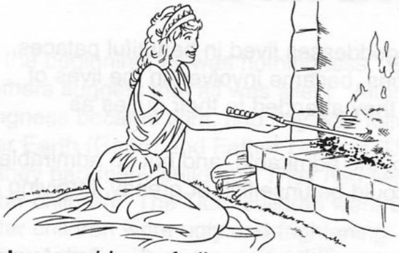
Hestia goddess of the hearth and home

Hestia was known for her pure and simple life. On Mount Olympus she preferred a plain, wooden throne and the color brown. Her symbol was the hearth fire.