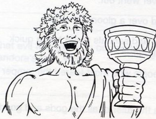
Dionysus god of wine, parties, and drama

Dionysus is recognized by ivy or bunches of grapes, a wine cup, or a leopard.