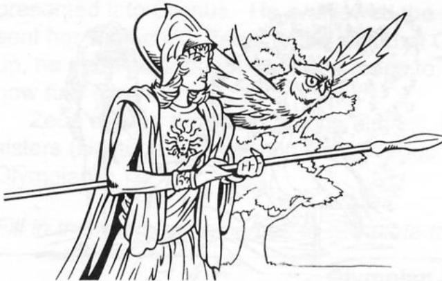
Athena goddess of wisdom, statecraft, and war

Athena is said to have emerged from Zeus's head, full grown and wearing her armor. Athena's symbols were the owl and the olive tree. Her aegis, or breastplate, was a gift from Zeus and showed the head of Medusa.