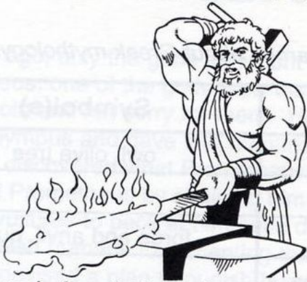
Hephaestus god of blacksmiths, metalworkers, and craftsmen

Hephaestus was the son of Zeus and Hera. The forge and anvil (metalworking tools) were his symbols. His favorite bird was the quail.