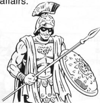
Ares god of war, hatred, and violence

Ares was known for his short temper. He was identified by dogs, vultures, or a spear and shield.